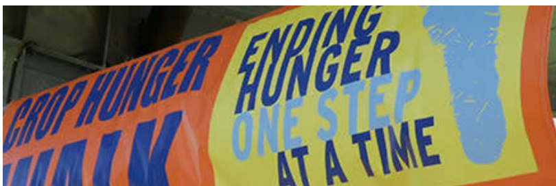
First Baptist Church, New Bern